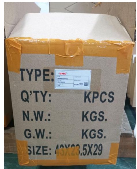
Table 1. Packing information