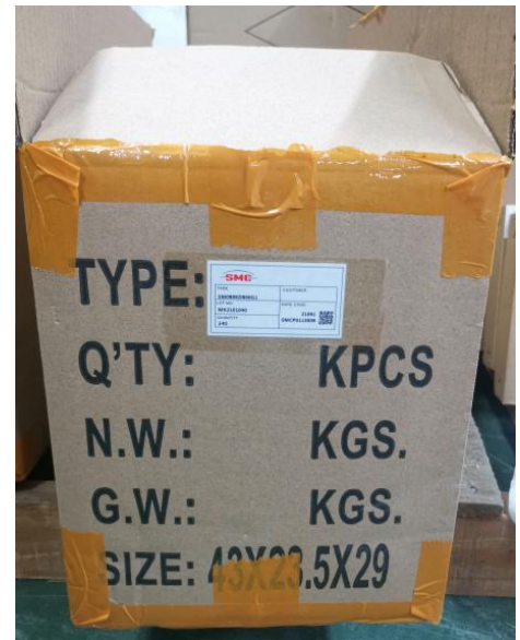
Table 1. Packing information